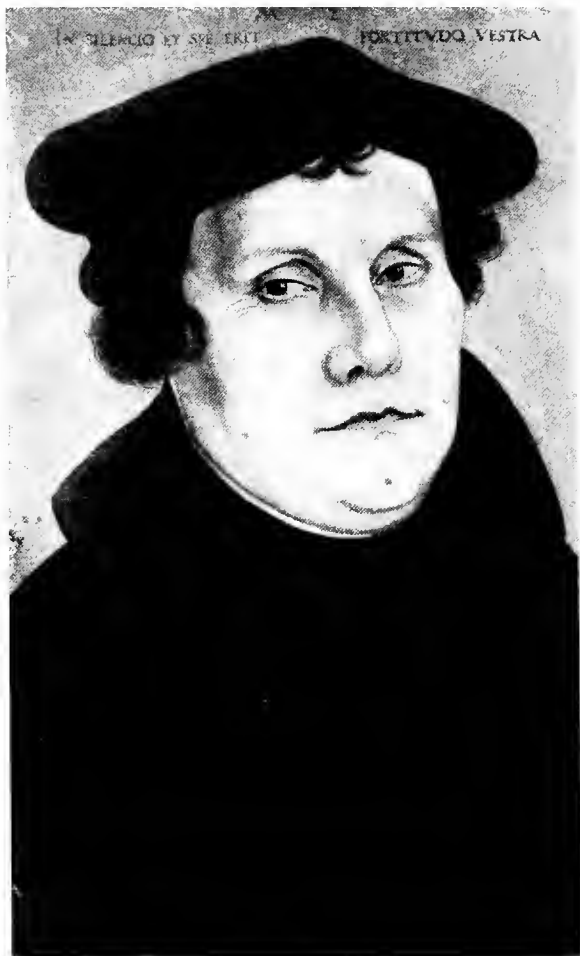
Portrait of MARTIN LUTHER By Cranach. Original in Milan.